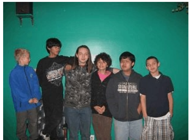
Junior Order members on January 15, 2008