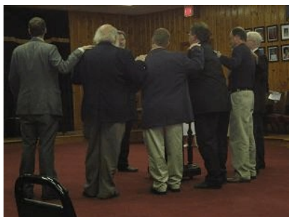
Stonewall Jasper #6 2009 Officers